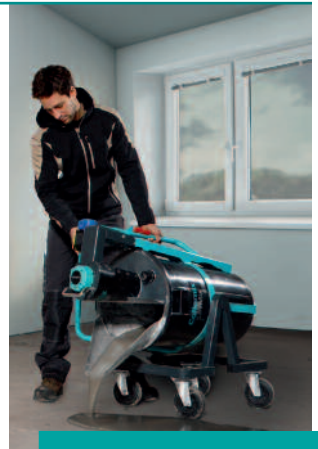
3 Pouring out